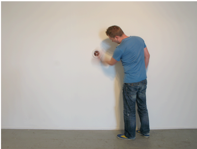
Fig. 8: Helgi Kristinsson, Suck , 2010. Mixed media.