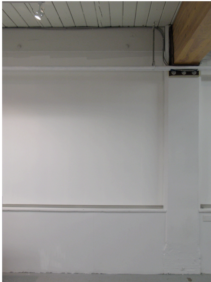
Fig 4: 1612 Gallery.