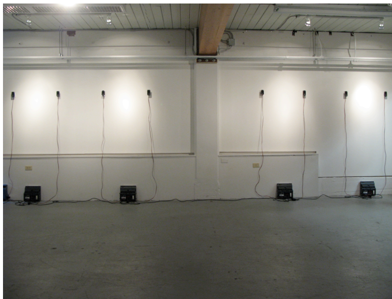
Fig. 2: Helgi Kristinsson, Op.#1 , 2009. 8 channel sound installation. 1612 Gallery.