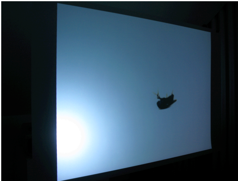
Fig. 7: Helgi Kristinsson, Passing of the Gallery Fly , 2010. Video installation. Dimensions variable.