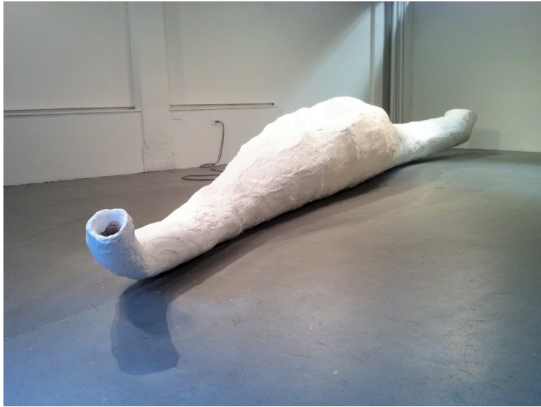
Fig. 9: Helgi Kristinsson, Color of Milk , 2011. Plaster, sound equipment and fan. Photo: Helgi Kristinsson