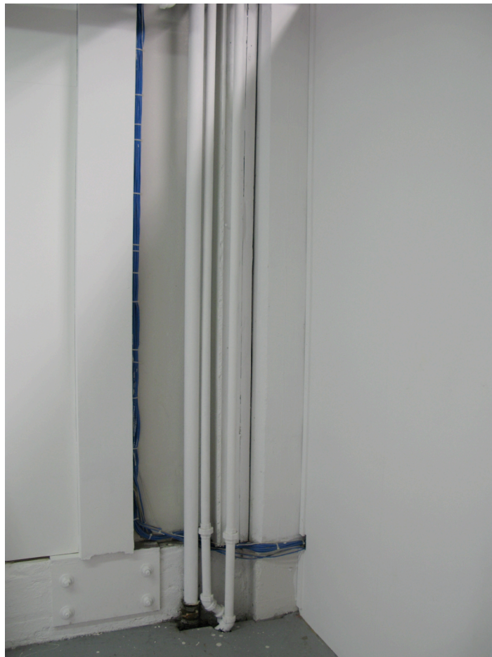
Fig. 6: 1612 Gallery.