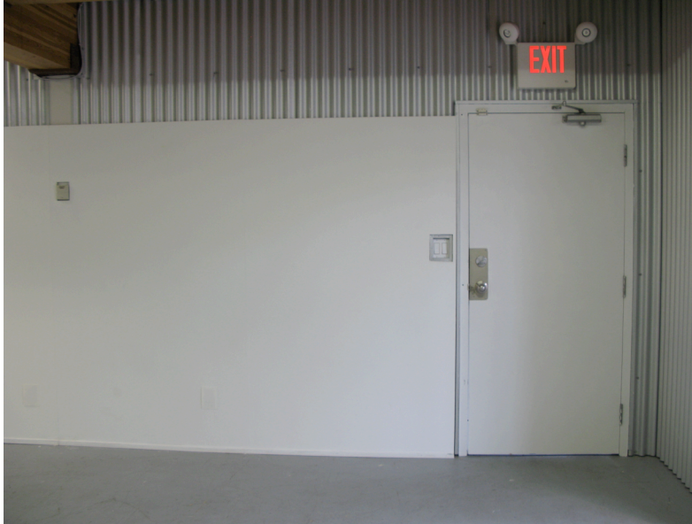
Fig. 5: 1612 Gallery.