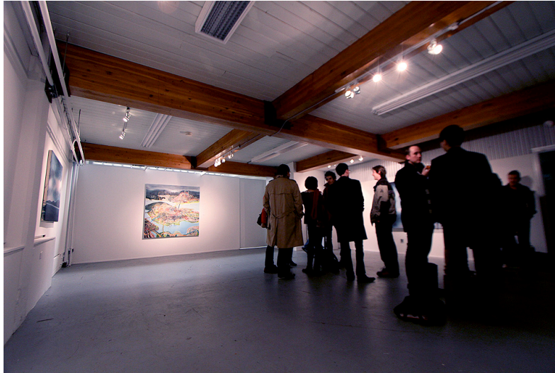
Fig. 1: 1612 Gallery. Documentation of the first opening at  Used by permission of the artist.

visible impressions obtained by a camera