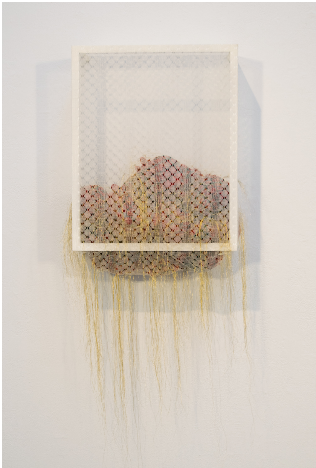
Fig.18: Juliana Silva Diaz, Anomalies , drapery lace, velvet, gold threads, fringe, 21"x17"x8", 2017.