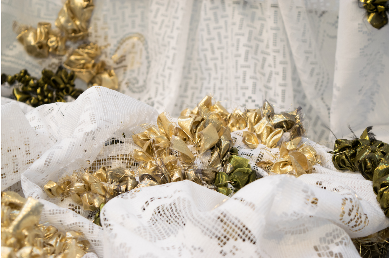
Fig.12: Juliana Silva Diaz, Fungi , drapery lace and lamé, dimensions variable, 2017. (Detail).

Fungi is a piece that looks like a curtain with two layers of fabric – one in lace, the other in lamé – installed in the middle of the space hanging from the ceiling, that allows the viewer to walk around it. The lace has a floral pattern and its formation is based on geometric shapes. I pull the gold lamé through the tiny holes of the lace, using the fabrics in unexpected ways, and perhaps enabling the two fabrics to “misbehave.”