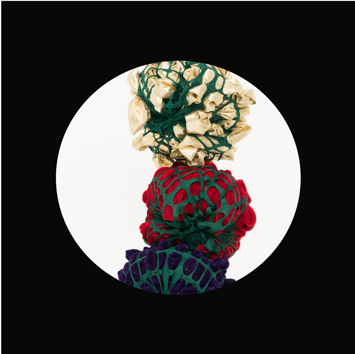
Fig. 9: Juliana Silva Diaz, Specimens (image 2) , inkjet print on enhance matte paper, 32" x 32" 2016.

(Subversive Beauty 20) I am interested in the loss of the functional purpose as well as the decorative function of objects in order to create an enigmatic piece.