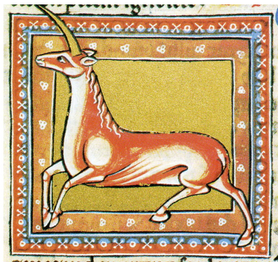
Fig.4: Monoceros . The Ashmole Bestiary, Early 13 th century.

half dragon and half goat, half horse and half human, and so on. The representation of monsters, hybrids and anomalies was a mean to represent amorality. These depictions produced discomfort for the unknown and curiosity at the same time.