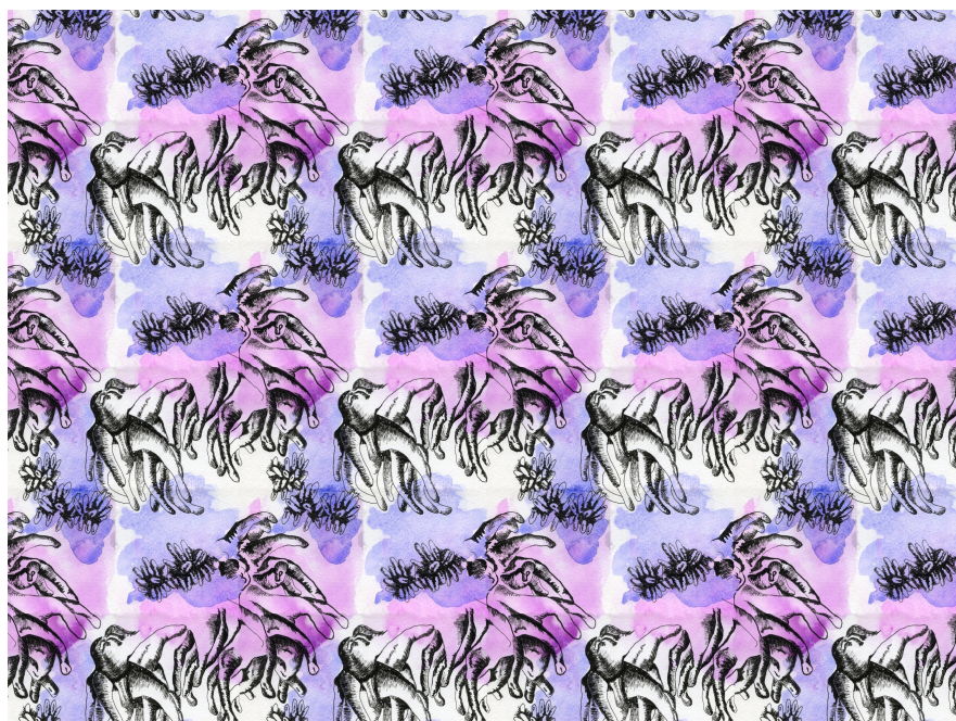
Fig. 6: Juliana Silva Diaz, Wrapping paper , laser print on bond paper, dimensions variable, 2015.