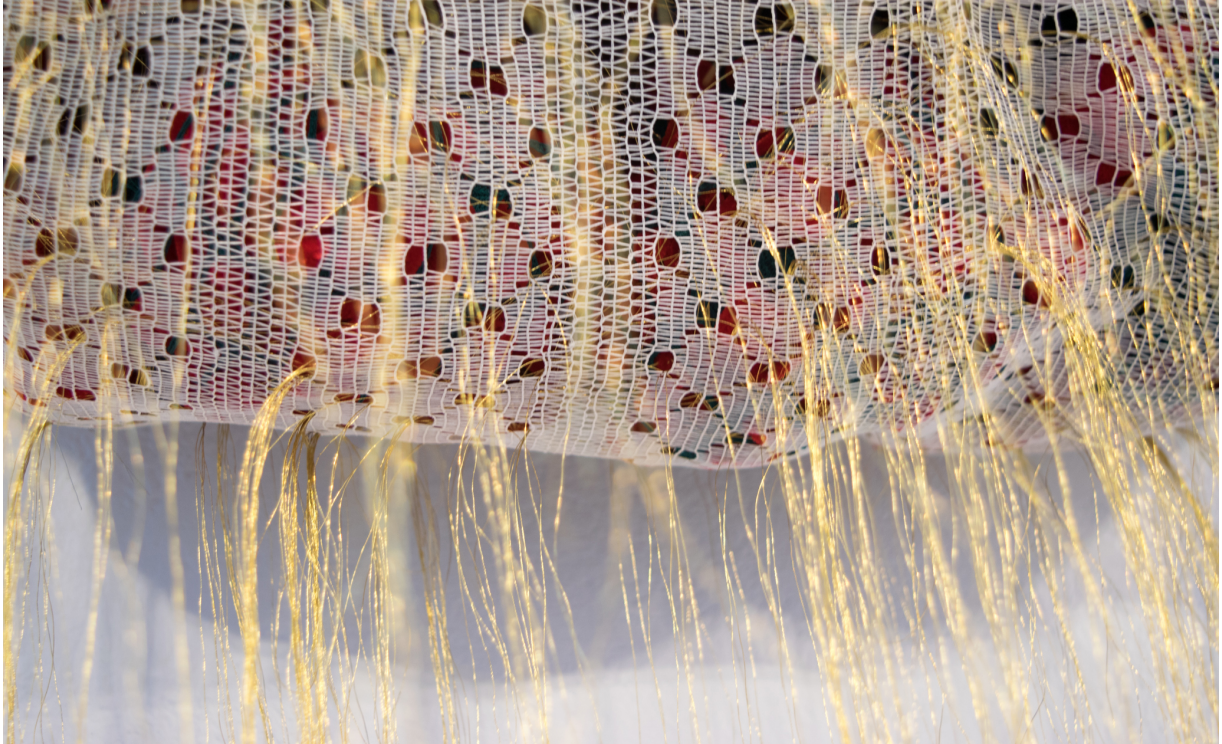
Fig.19: Juliana Silva Diaz, Anomalies , drapery lace, velvet, gold threads, fringe, 21"x17"x8", 2017. (Detail)

Anomalies is a poetic commentary about containment, control, domestication and human vulnerability. The creatures inside the boxes are expanding beyond the limits of the containers that house them. Although there is not a direct violence between the content and the container, forces are colliding and merging. For example, the lace that establishes the limits of the box is both stretching and resisting—the pieces inside are coming out and pushing the border of the container. Anomalies , like the cabinet of curiosities, denotes a desire of having nature under control, a piece of wilderness or a taste of abnormality in the safe surrounding of our living room.