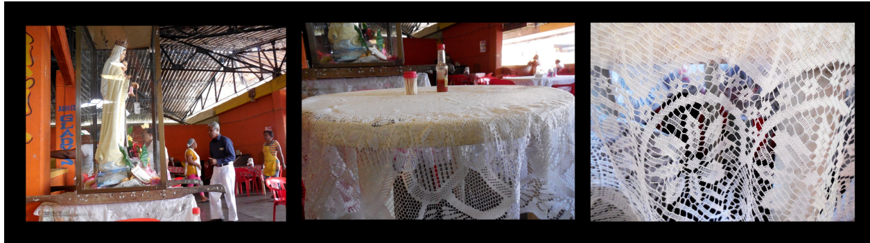
Fig. 14: Juliana Silva Diaz, Polyester lace tablecloth in Buenaventura's Public Market, Colombia, 2013.

affordable fabric, and even though the material doesn't have the status of more expensive fabrics, visually it performs the same job that a more expensive one does.