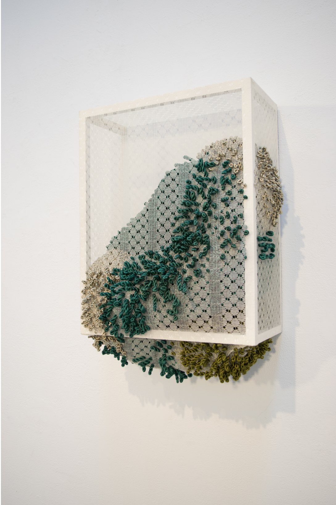
Fig.16: Juliana Silva Diaz, Anomalies , drapery lace, velvet, gold threads, fringe, 21"x17"x8", 2017.