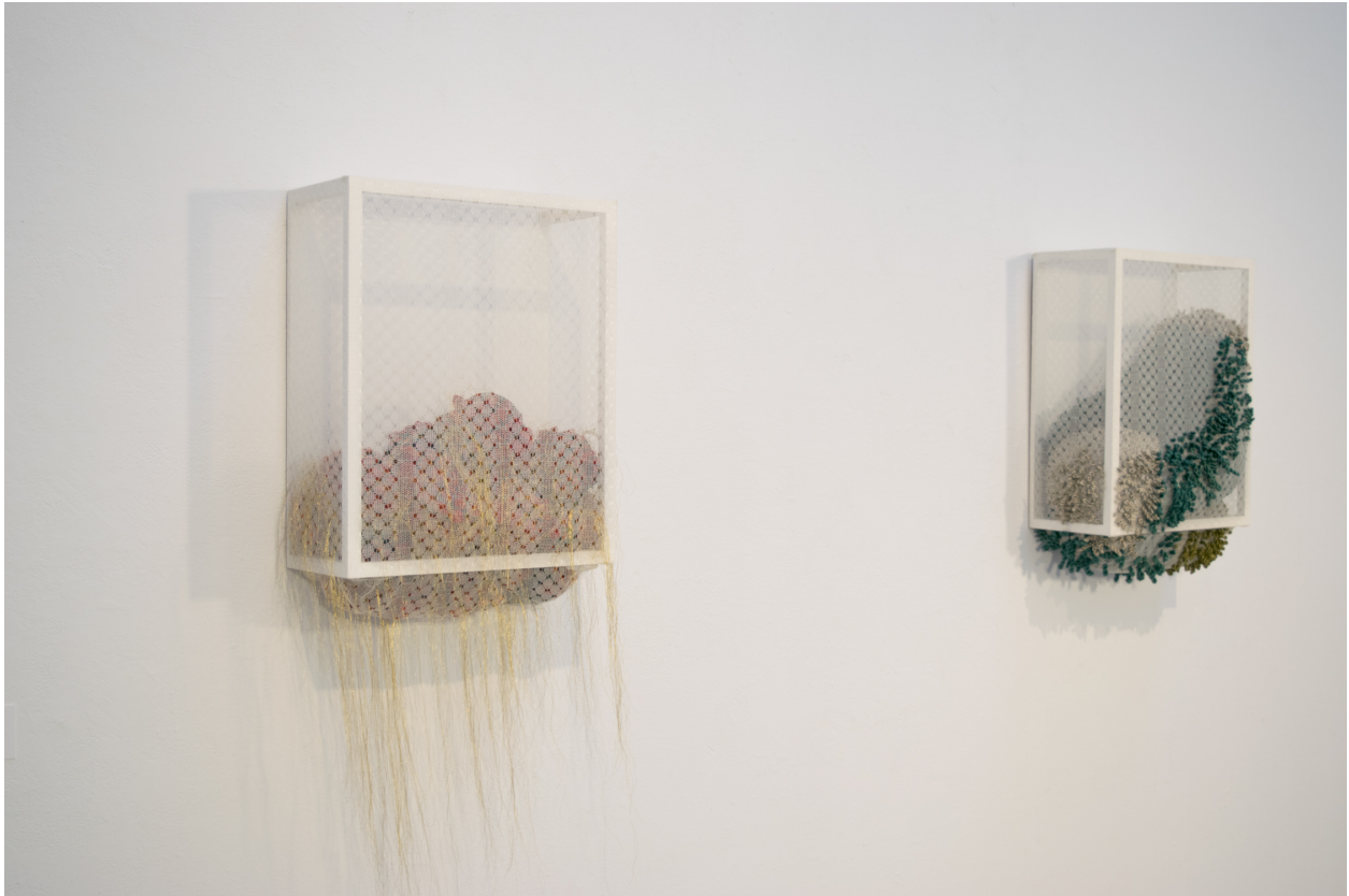
Fig.15: Juliana Silva Diaz, Anomalies , drapery lace, velvet, gold threads, fringe, 21"x17"x8", 2017.

My intention was to create pieces that generate certain familiarity because the treatment of the materials still allows the viewer to recognize them, although the final form produces confusion. The lace was placed intentionally to make the observation of what is inside more challenging. Additionally, in order to complicate the experience, I made forms that suggest organic shapes to reference nature. These include plants, sea creatures, living microorganisms, and organs.