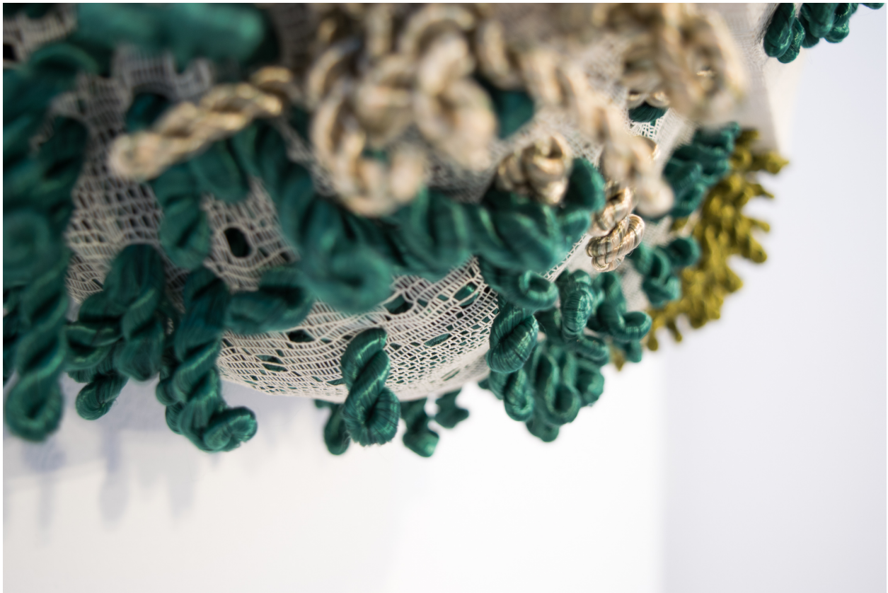
Fig.17: Juliana Silva Diaz, Anomalies , drapery lace, velvet, gold threads, fringe, 21"x17"x8", 2017. (Detail)

Gestures that I applied to the pieces, such as the tumors that deform the boxes or the material that was pulled out through the mesh, became gestures to alter perception. These gestures are an invitation to re-evaluate the cultural borders and to re-think our bodies in terms of the included and the excluded.