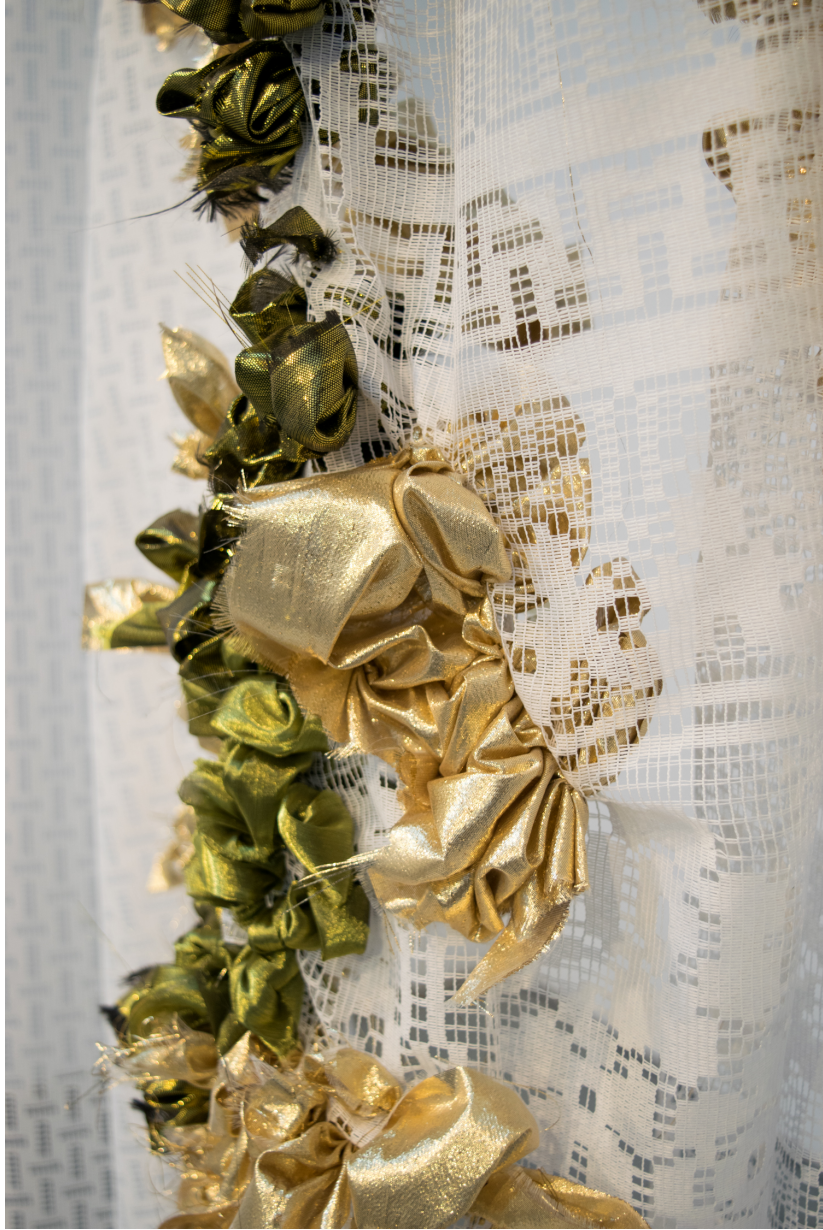
Fig.13: Juliana Silva Diaz, Fungi , drapery lace and lamé, dimensions variable, 2017. (Detail).

Fungi , is made with white polyester drapery lace and gold lamé. This kind of fabric is commonly used for curtains or tablecloths, very popular in Colombia for being inexpensive and resilient; it is also prevalent in working class home decoration (Fig.14). Polyester lace is a resilient and