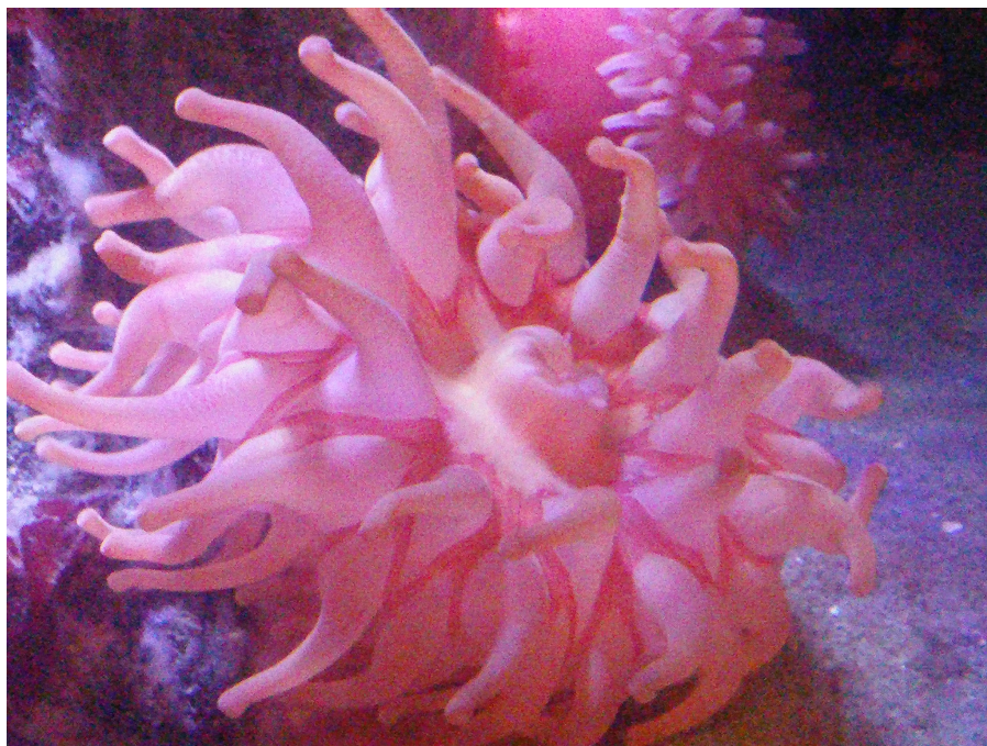
Fig.5: Juliana Silva Diaz, Anemone , personal inventory, 2013.