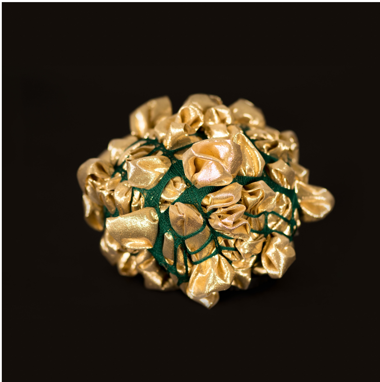
Fig. 10: Juliana Silva Diaz, Specimens (image 3) , inkjet print on enhance matte paper, 32" x 32" 2016.