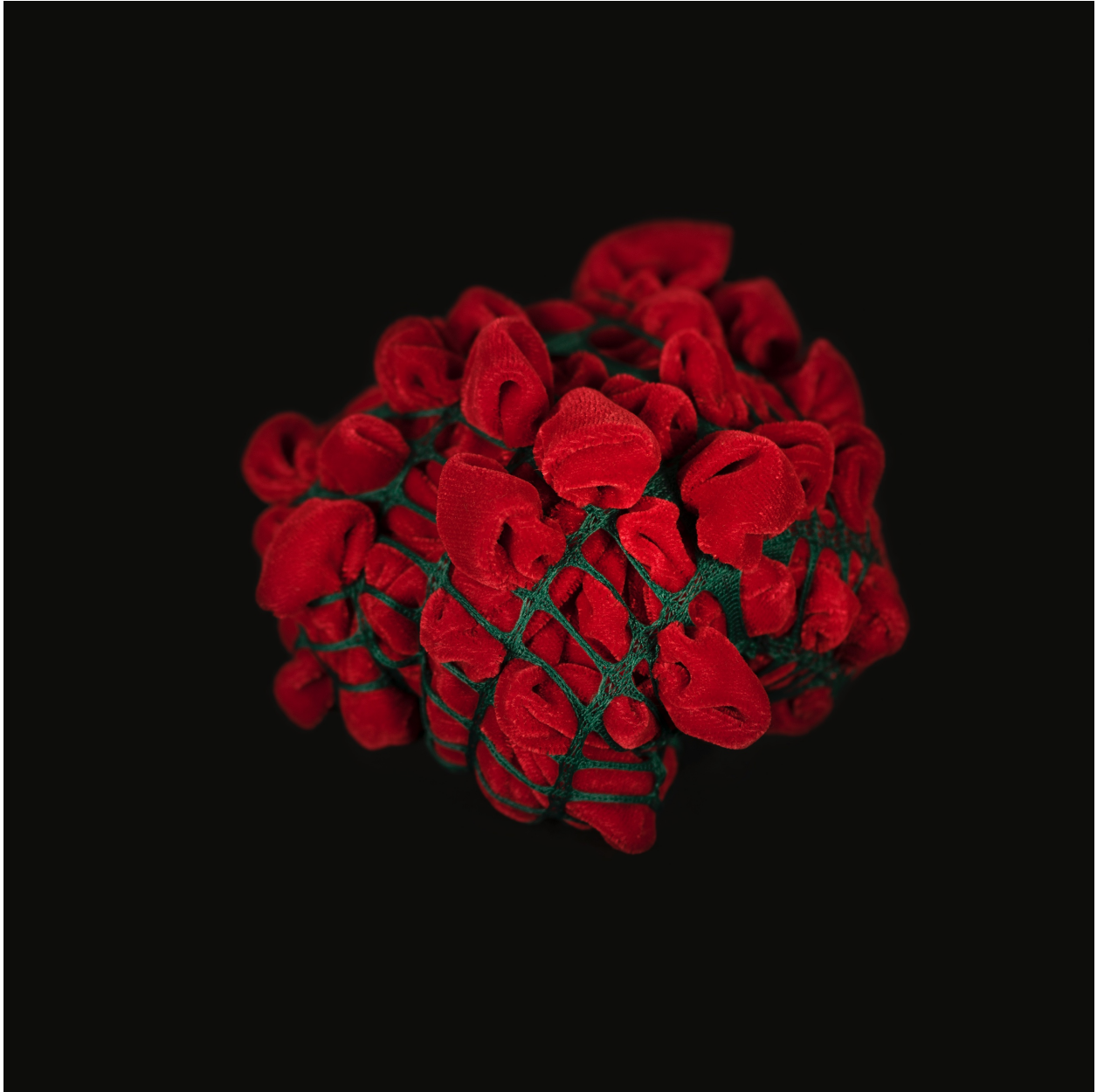
Fig. 8: Juliana Silva Diaz, Specimens (image 1) , inkjet print on enhance matte paper, 32" x 32" 2016