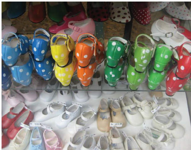
Spanish Shoes, Monique Fouquet